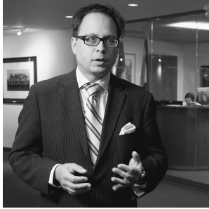
Denzil Minnan-Wong Deputy Mayor, Toronto