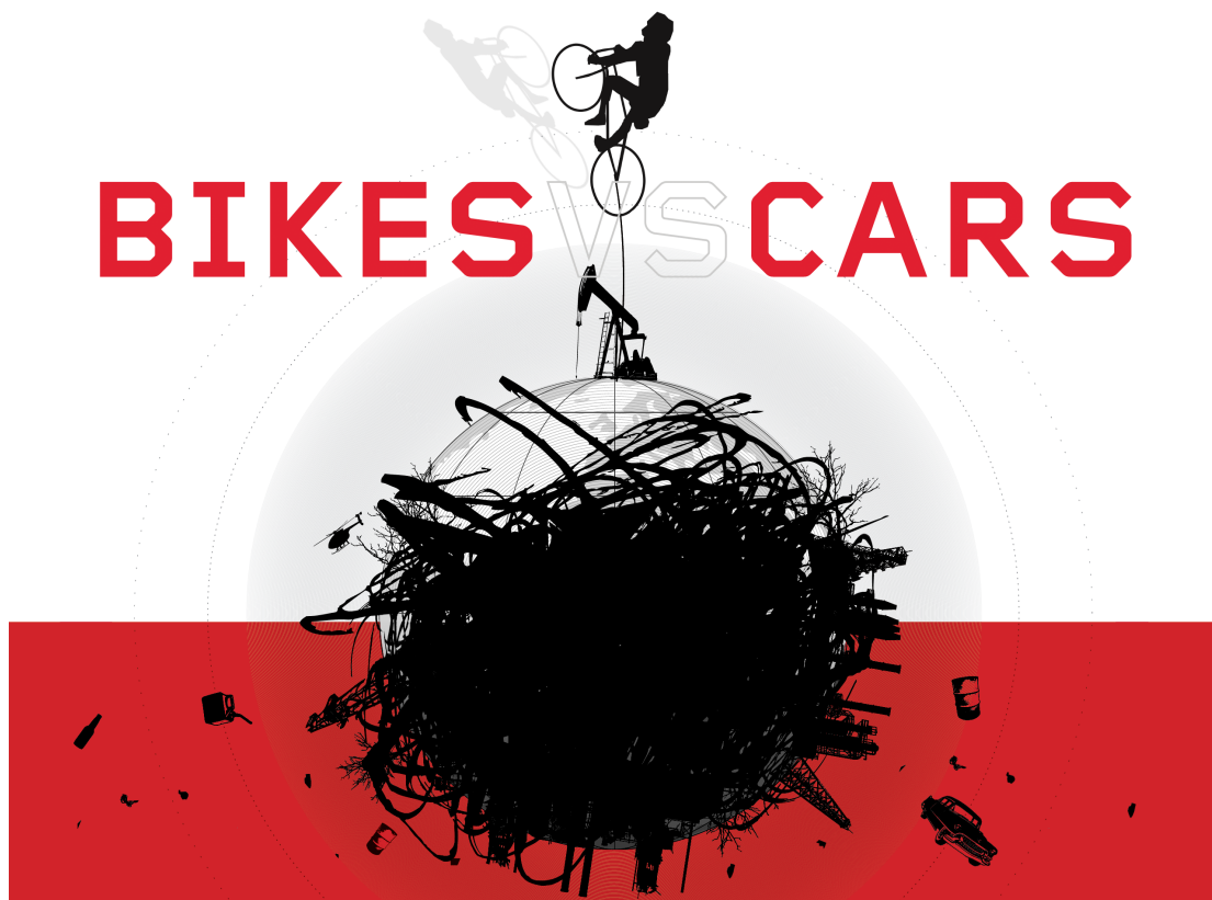
BIKES vs CARS Title image 1. Design: Rebeca Mendes