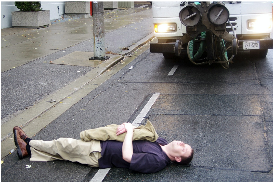
Bike activist protesting against the removal of the Jarvis bike lane, Toronto, Canada.