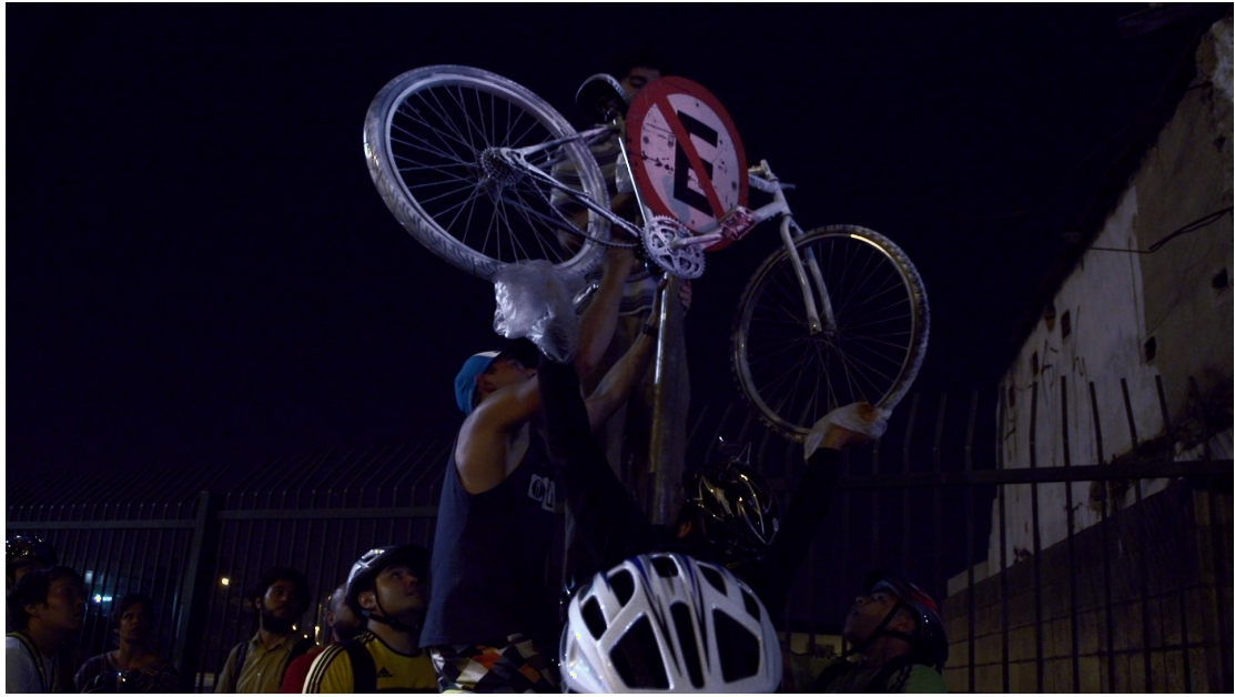
Ghost bike memorial ride, São Paulo, Brazil.