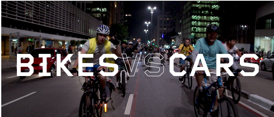
BIKES vs CARS Title image 2; Ghost bike memorial ride, São Paulo, Brazil.