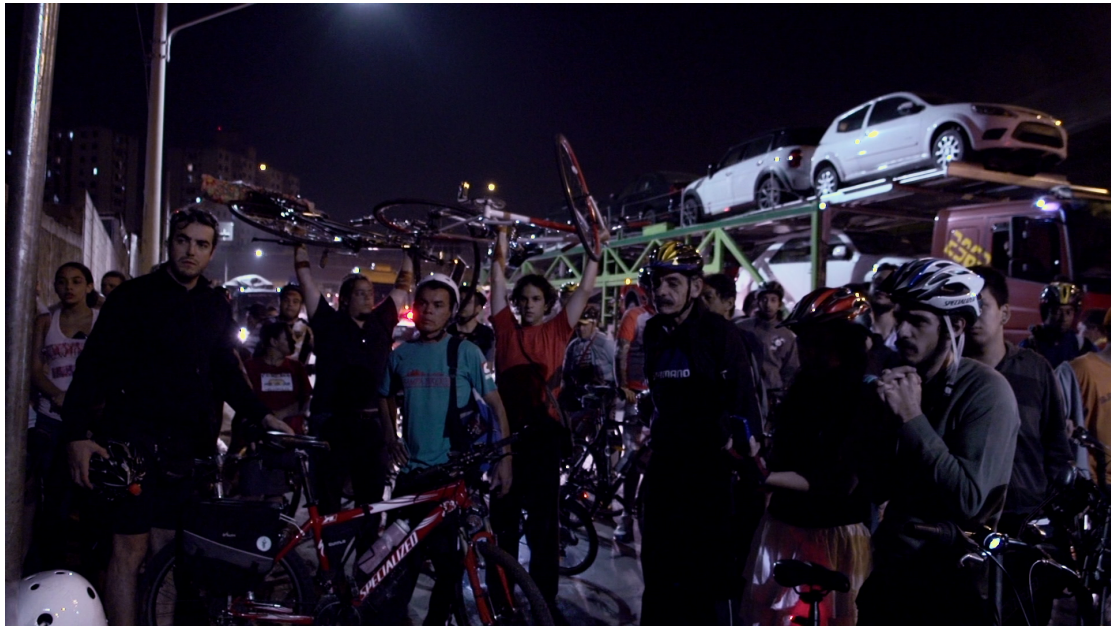
Ghost bike memorial ride, São Paulo, Brazil.